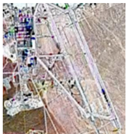
Area51 Users Guide :

7.0 Edition Published Dec 01 2017 Copyright © 2017 University of California